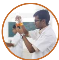
Research and Innovation Club