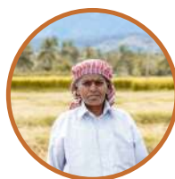
Extension and Outreach Club